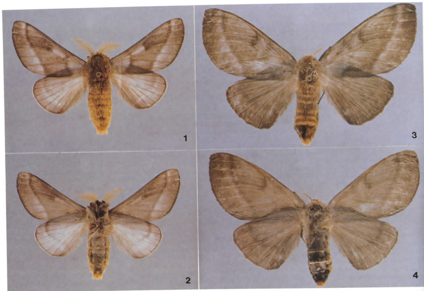
Fig. 1-4. Jaiba kesselringi Lemaire, Tangerini & Mielke, new sp.: 1) holotype ♂ (wingspan: 46.5mm), dorsum. 2) Same, venter. 3) allotype ♀ (wingspan: 59mm), dorsum. 4) Same, venter. (all figures enlarged 1.6x).

simple). Frons brown; thorax dorsally brown interspersed with a few yellowish gray hairs on the tegulae, thorax ventrally and legs brown; abdomen dorsally brown intermixed with yellow, ventrally brown with a dull purplish tinge. Forewing grayish brown, suffused with dull white on the antemedial area and the discal cell; antemedial line dark brown, very narrow, slightly angulate; postmedial line dull white, broad, preapical, subparallel to the outer margin; there is a small, brown, rounded discal spot. Hindwing lighter grayish brown than the forewing, with only marking a vague, whitish, slightly convex postmedial line. Underside similar to the upperside with a lighter grayish brown coloration. Venation conspicuous on all four wings above and below. Genitalia . See description of the genus.